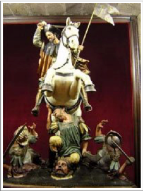
St. James the Moor-Slayer. This famous statue is on display in the Cathedral of Santiago de Compostela. While one Muslim is being trampled to death under his horse's hooves, two other dying Moors flank him on either side. Directly in front is a Moor's head separated from its body, blindly staring up at his killer.

A Moor's head "dates back to the Middle Ages when it was considered an honor to take a Moor's head." Such symbology is not only a racial insult, but is also an affront to every Muslim as Moors were, without exception, of the Islamic faith. The Crusades mercilessly slaughtered Muslims, Jews and apostolic Christians alike. It was during the Crusades that it was considered an honor to decapitate a Moor because of his religion.