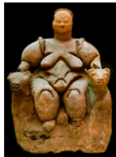
The famous leopard-enthroned goddess from the granary at Çatal Hüyük.

"Also known as Kybele and Magna Mater and the Mother of the Gods, the worship of this Goddess spread throughout the Roman Empire. As a Phrygian deity, She was a Goddess of caverns, of the Earth in its primitive state; worshipped on mountain tops. She ruled over wild beasts, and was also a bee Goddess. Cybele was the Goddess of nature and fertility. Because Cybele presided over mountains and fortresses, Her crown was in the form of a city wall.