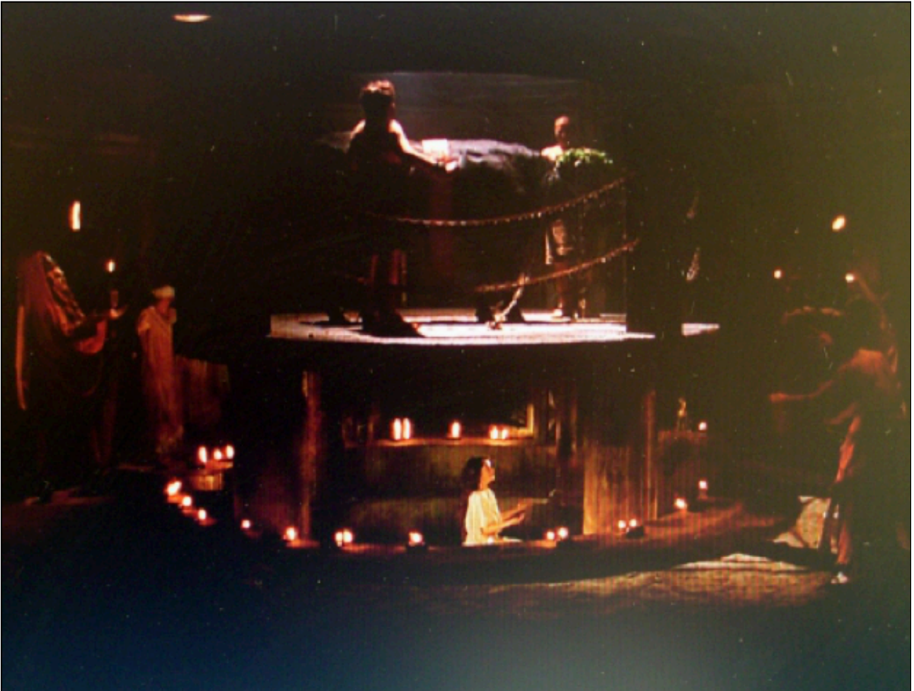
Atia undergoing the taurobolium from HBO/BBC's series "Rome"

Dionysius of Halicarnassus records that specific laws were passed when some of the undesirable aspects of the Cybele cult became apparent. Cybele's religion was a bloody cult that required its priests and priestesses as well as followers to cut themselves during some rituals. The priests castrated themselves at their initiation; there was wild music, chanting, and frenzied dancing. "As part of their worship, priests also performed mysterious rites in Her honor. Of particular note was the sacrifice of a bull performed as part of an initiation into Cybele's cult. This ritual was known as the taurobolium, and during the rite a candidate for initiation stood in a pit under a floor with a wooden grate. The bull was sacrificed above the grate, and the blood ran through holes in the wood, showering the initiate. This was a form of ritual purification and rebirth."