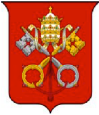
Vatican City coat of arms displaying the keys of Janus and Cybele, now claimed by the pope. This emblem also appears on a white and gold background on the

Taking advantage of the credulity of the Christians, the pope secured for himself the preeminent position of power as the head of both the Christian Church and the pagan religion.