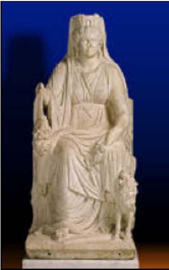
The goddess Cybele

The cult of Cybele is said to have originated in Asia Minor, near Pergamum. As a deity connected to the concerns of women, as a healer, and as a protector from enemies, Cybele was often associated with Rhea, mother of Zeus and Demeter. Cybele is known by several epithets, such as Magna Mater and Mater Deum (deum = deorum, a syncopated poetic form). Her home was said to be Mount Ida, near the city of Troy. Early depictions show her first as a lump of black stone, then as an earth mother. After the Greeks colonised Asia Minor, the cult spread -- but not without violence. A priest of Cybele is said to have been murdered while trying to introduce the cult into Athens. When the city was struck by a plague, Greeks consulted an oracle (probably the one at Delphi) and were told to build a temple to Cybele.