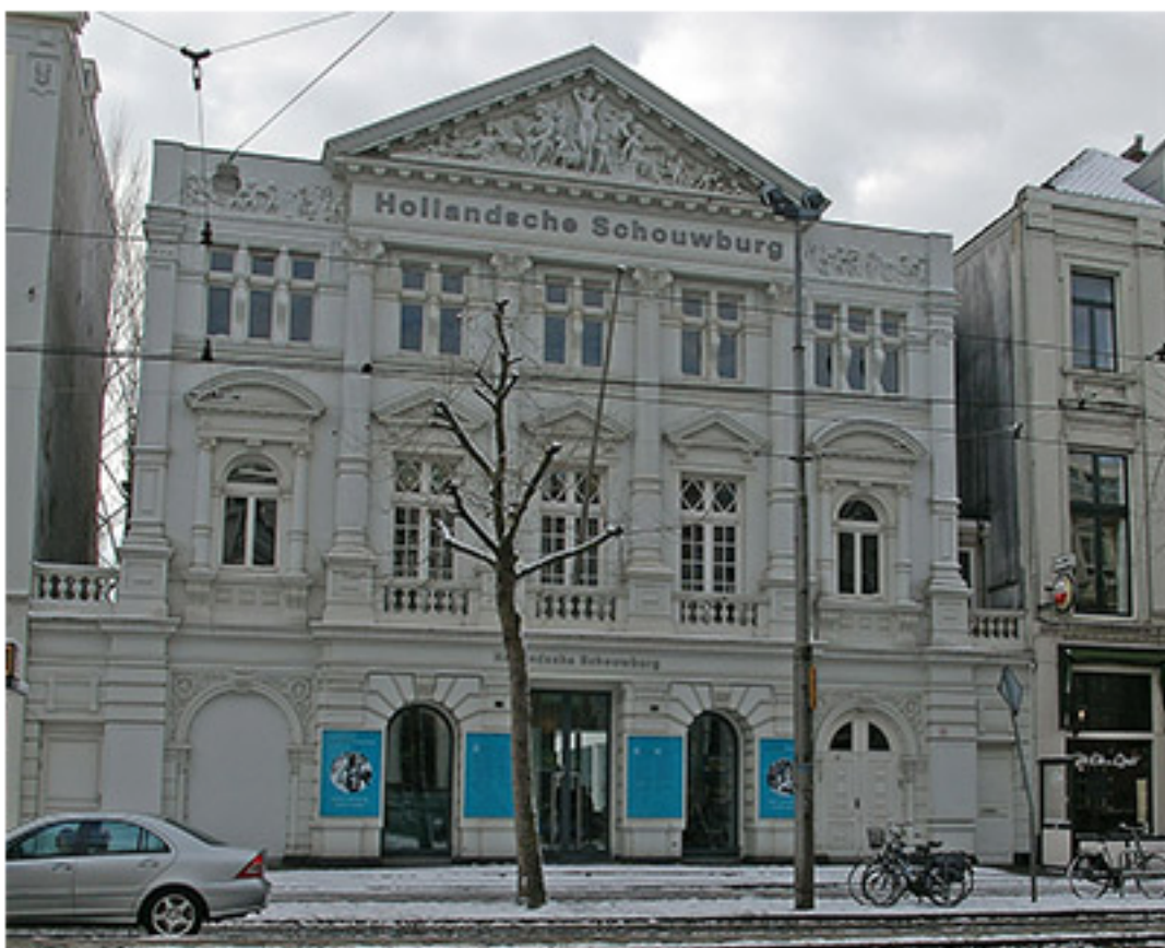
Hollandsche Schouwburg was a luxurious theatre in a vibrant Jewish neighborhood of Amsterdam. Here, 80,000 Jews were collected between 1942–1943 for deportation to death camps. It is now the National Holocaust Memorial of the Netherlands.