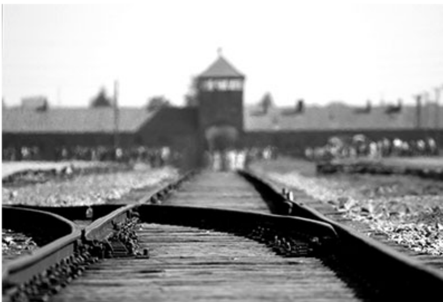
Train track ending at Auschwitz Concentration Camp.

"For me the war never goes away. I have seen with my own eyes how all those children left on train 9, and how two Nazis picked up a Jewish girl's toy doll. Those images are forever burnt on my retina." ( 2011 interview, nrc translated )