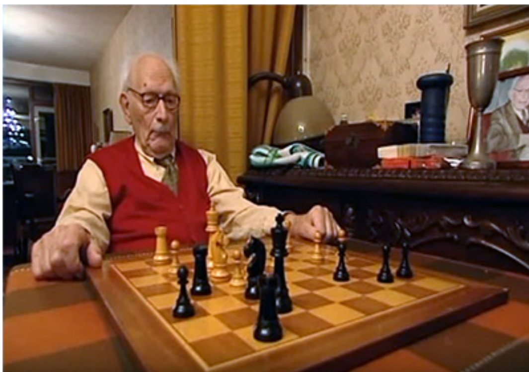
Johan van Hulst was an avid chess player, winning the Corus Chess Tournament for (former) Dutch politicians at the age of 95 and again at 99.