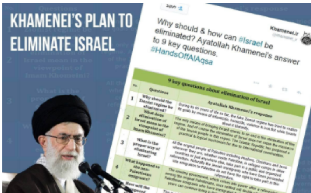
Iran's Supreme Leader, Ayatollah Khamenei published a nine-point plan on Twitter to eliminate Israel, November 4, 2014.

They chose not to hear or believe the clear plans for Jewish eradication in Hitler's writings and speeches. Just as people today don't hear or believe the many Islamic threats, including Iran's clear plans to launch nuclear weapons into Israel to exterminate the Jewish people.