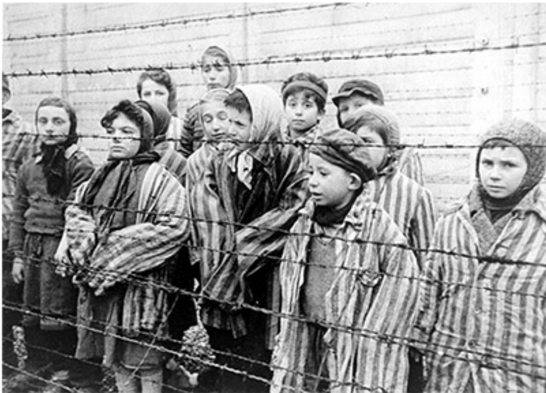
These children were liberated from Auschwitz by the Red Army in January 1945.

"We say, those who save one life saves a universe. You saved hundreds of universes. I want to thank you in the name of the Jewish people, but also in the name of humanity."