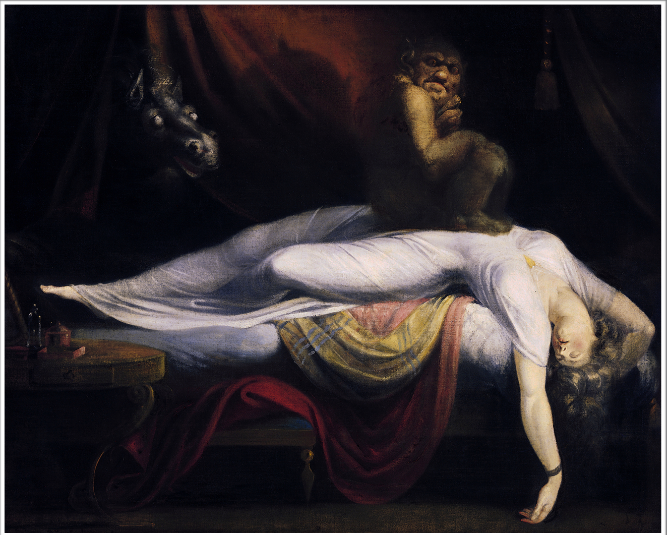
The HAG who in mythology holds captive the BRIDE.

The malicious crone who the French called CAROGUE derived her manifestation as a CARRION the BLACK BIRD of DEATH who feeds on the dead – the same winged dragon that flies in the Zeiss Mocha museum in Cape Town called the “ Bird of Witches. ”