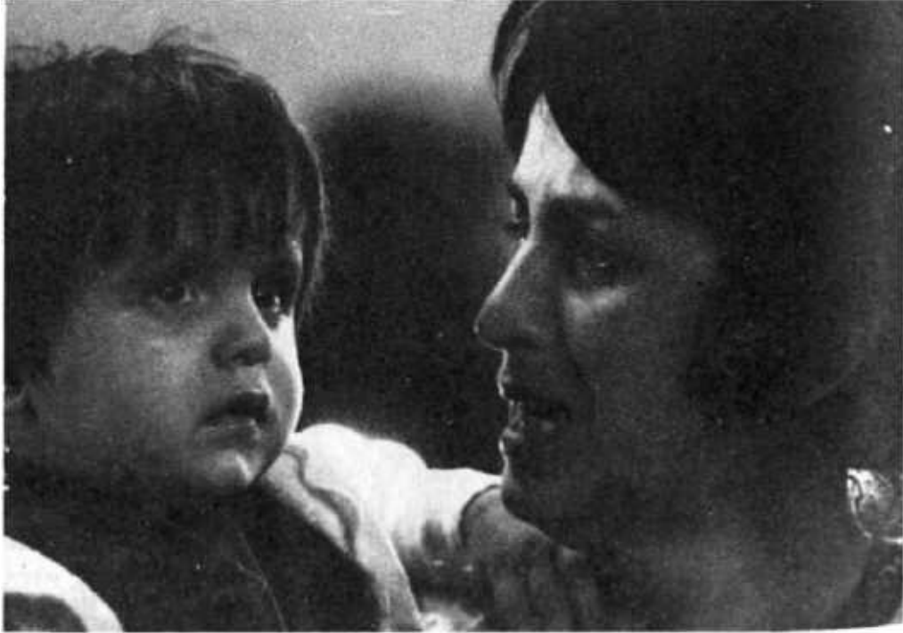
Tears of joy flood the face of this mother as her baby, who has been blind since birth, is able to see!