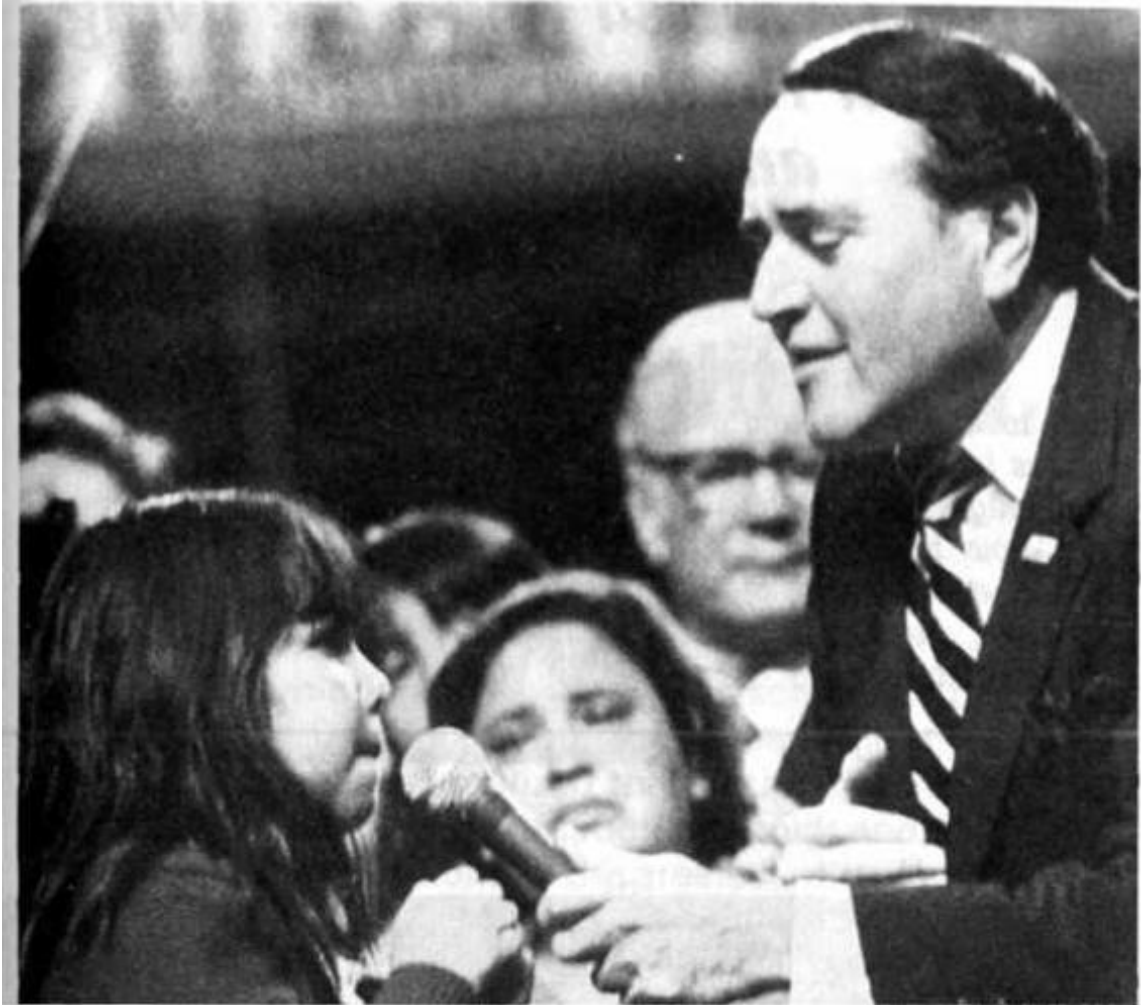
Deaf girl after being healed says "Mama" for the very first time!